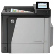
HP Color LaserJet Enterprise M651n

Count on performance. Print professional-quality, two-sided color documents—letter and A4—with outstanding reliability. 1 Efficient one-touch printing and mobile printing options plus simple management help you be productive wherever work takes you.