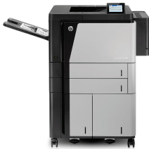
HP LaserJet Enterprise M806x+ Printer