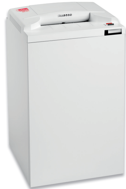
W/D/H 49 x 44 x 90 cm