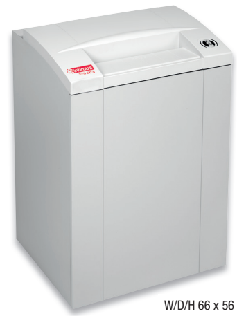
W/D/H 66 x 56 x 105 cm

Professional Data Shredders – a Synthesis of Technology, Performance and Design. All intimus® shredders are built from durable, precision engineered, high-performance components, designed for a long life of high volume usage. The product range covers all requirements from day-to-day office use up to High Security Shredding machines in use for destruction of classified material in line with all current legal requirements such as DIN 66399 or NSA 02/01. intimus® shredders carry various features which make them unique in user-friendliness and operating efficiency.