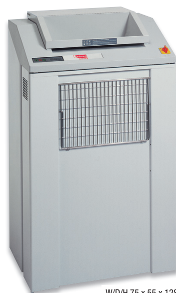
W/D/H 75 x 55 x 128 cm